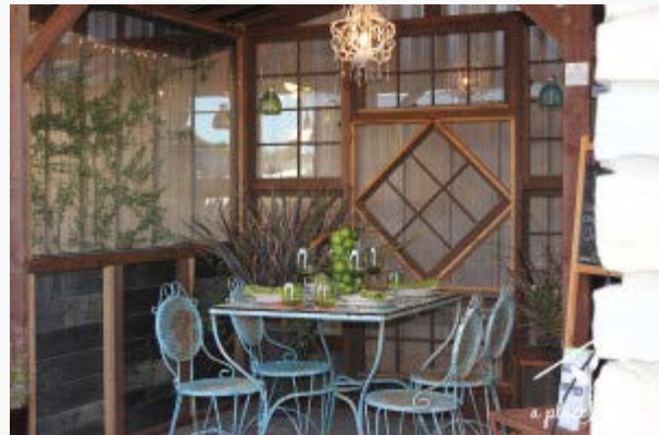
Outdoor Dining Room

A Place to Grow teamed up with Armet's Landscape at the 2013 Mid State Fair this past July and took home 1st Place And Best in Show for our Outdoor Dining Room!!